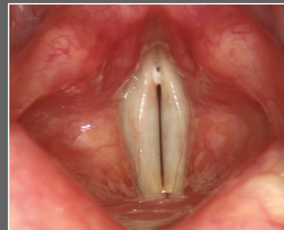
A healthy larynx

Sometimes, small amounts of these stomach juices can reach as far up as the throat (pharynx) and voice box (larynx). This is known as laryngo-pharyngeal reflux (LPR) and is sometimes called 'silent reflux' as many people with LPR do not experience classic symptoms of heartburn. Reflux can occur during the day or night, even if a person hasn't eaten anything.